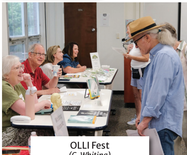
OLLI Fest (G. Whiting)