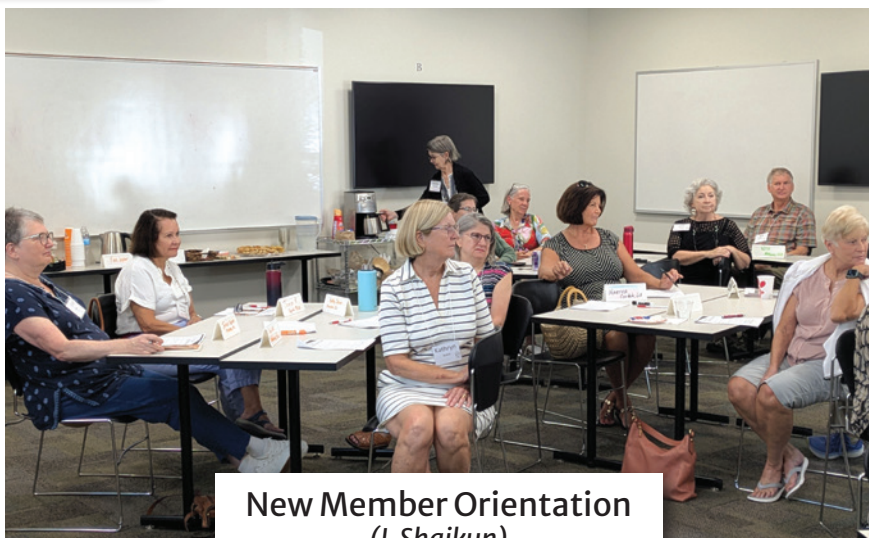
New Member Orientation