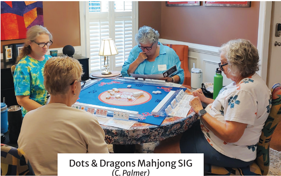
Dots & Dragons Mahjong SIG