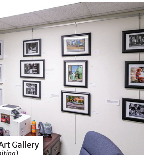
Art Gallery (Whiting)