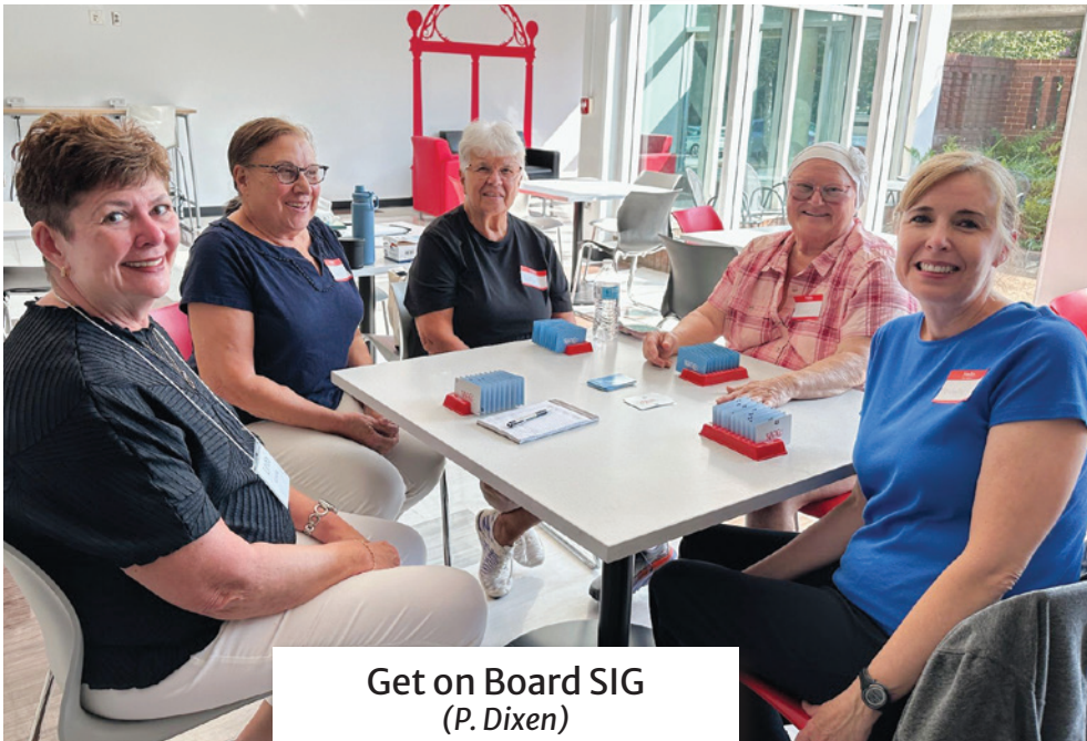
Get on Board SIG

We are OLLI OSHER LIFELONG LEARNING INSTITUTE THE UNIVERSITY OF GEORGIA®