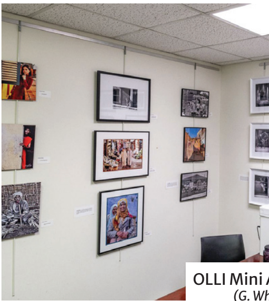
OLLI Mini (G. Wh)