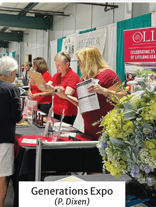
Generations Expo