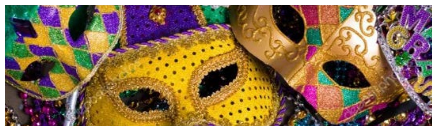
Mardi Gras Madness Tuesday, February 13, 4:00PM - 6:00PM

It's a party!!! Join us Mardi Gras Day at Trumps Catering for music, king cake, a second line dance, an Hors d'Oeuvres buffet, cash bar, non alcoholic beverage station, and the crowning of the King and Queen of Mardi Gras chosen from our attendees. Wear the traditional colors of purple, green, and gold. Mingling and Mardi Gras masks are a must. Come anytime, leave anytime and take some favors home.