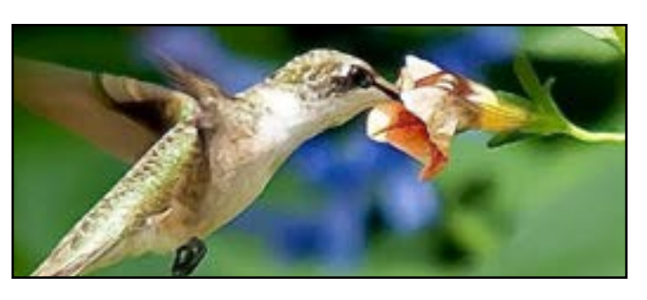
MARCH 5 Hummingbirds and Bluebirds: How to Attract, Feed, and Protect Them GARY WHITING