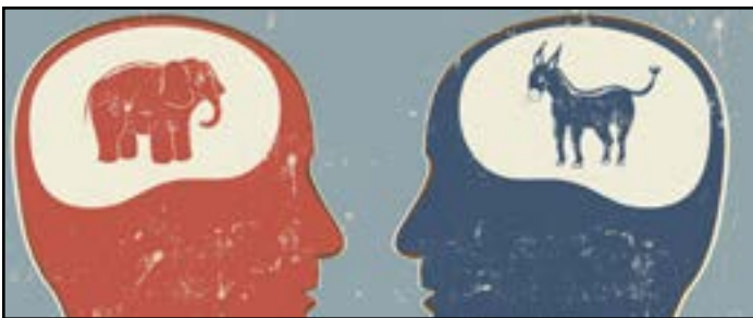
MARCH 19 Political Polarization in America: Are We Facing a Death Spiral? BOB GRAFSTEIN