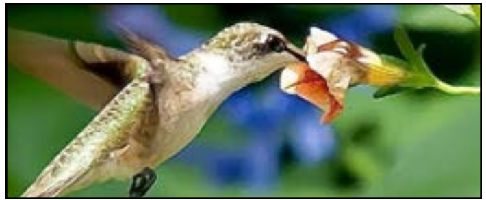
MARCH 5 Hummingbirds and Bluebirds: How to Attract, Feed, and Protect Them GARY WHITING