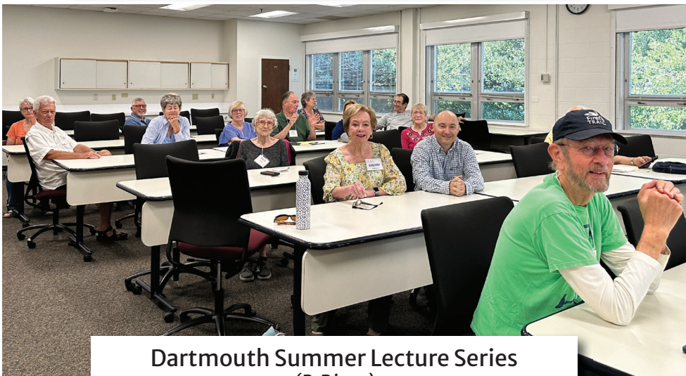
Dartmouth Summer Lecture Series

We are OLLI OSHER LIFELONG LEARNING INSTITUTE AT THE UNIVERSITY OF GEORGIA*