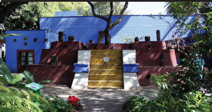
Tomb in the form of a pyramid, Frida Kahlo Museum Mexico City