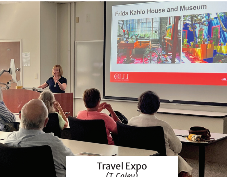
Travel Expo (T. Coley)