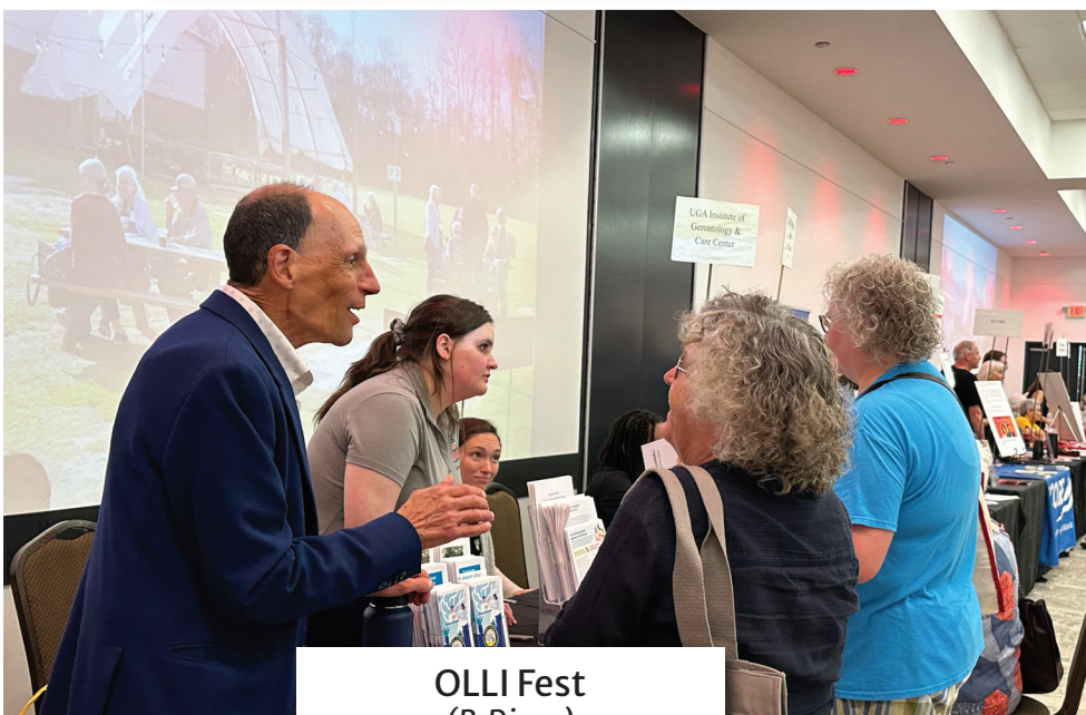
OLLI Fest

We are OLLI OSHER LIFELONG LEARNING INSTITUTE AT THE UNIVERSITY OF GEORGIA*