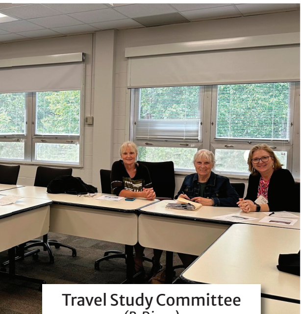
Travel Study Committee (P. Dixon)