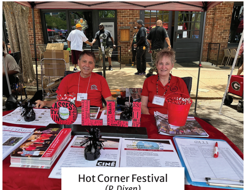
Hot Corner Festival (P. Dixon)