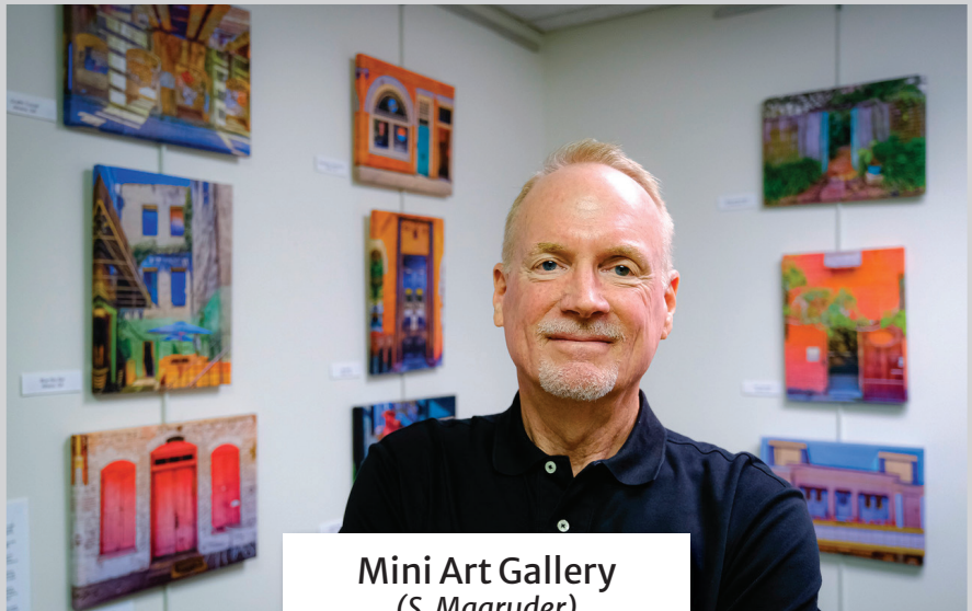
Mini Art Gallery (S. Magruder)