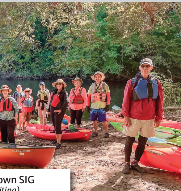
Down SIG (iting)