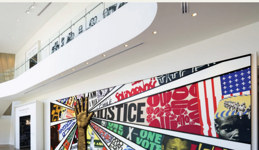
National Center for Civil and Human Rights