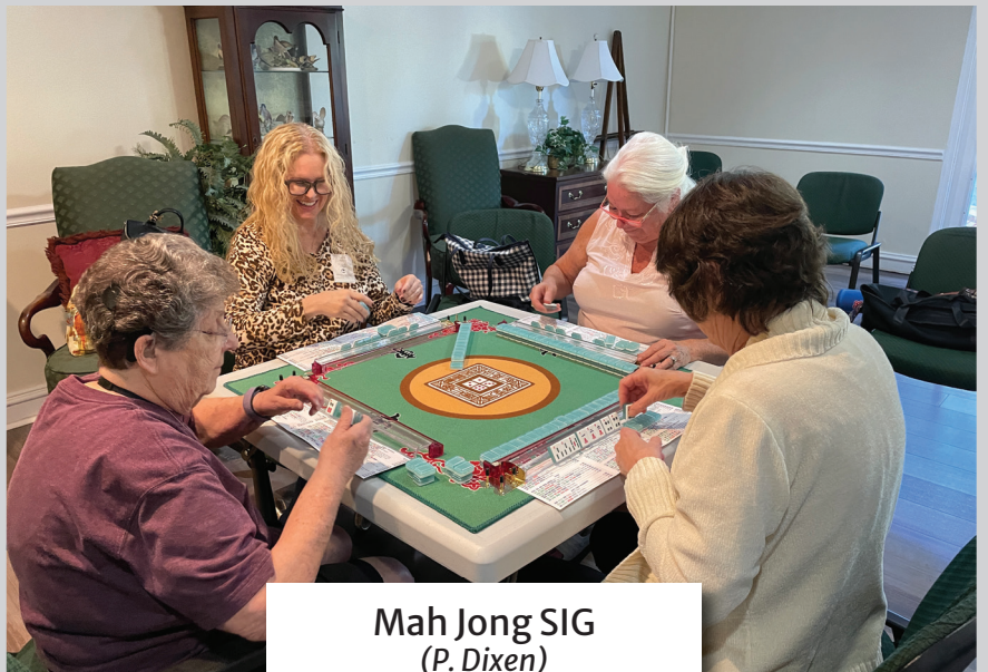
Mah Jong SIG