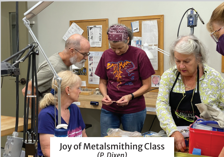
Joy of Metalsmithing Class