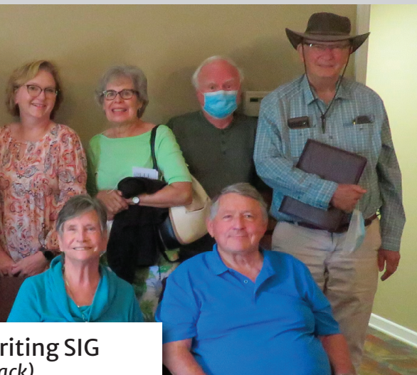
Writing SIG (ack)