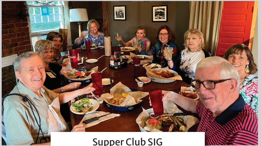
Supper Club SIG