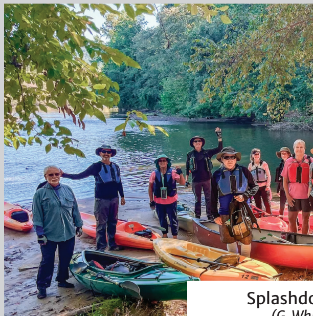
Splashdo