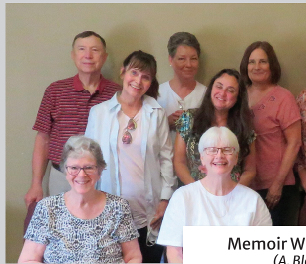
Memoir W