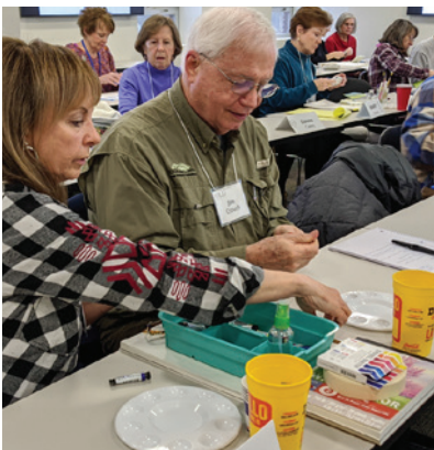
Members enjoy our Saturday watercolor class.