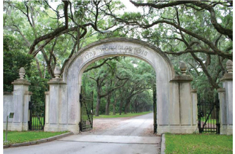
Wormsloe Historic Site gate