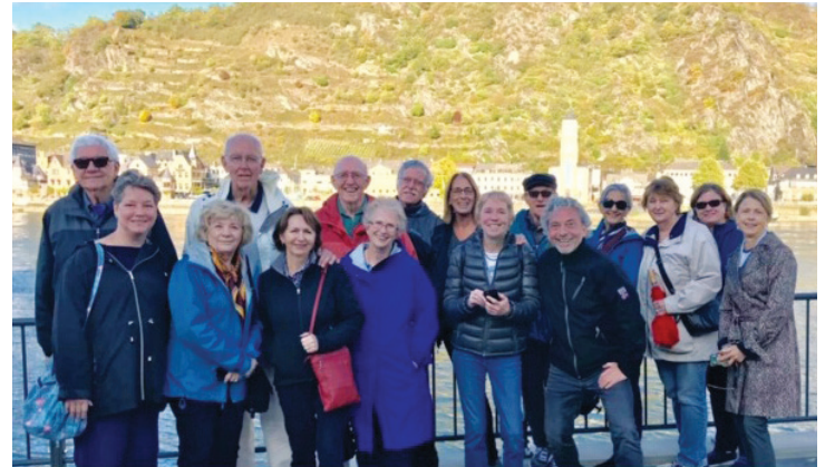
OLLI travelers in St. Goar next to the Rhine river.