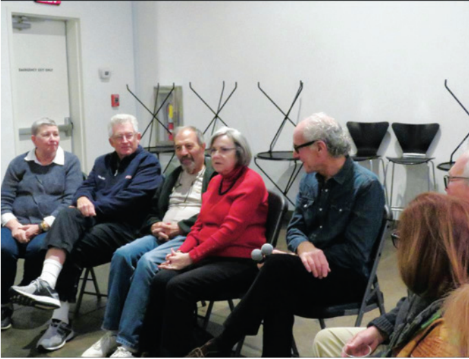
Robert Alan Black

Cinema@Cine SIG members discuss “A Beautiful Day in the Neighborhood” at their December meeting.