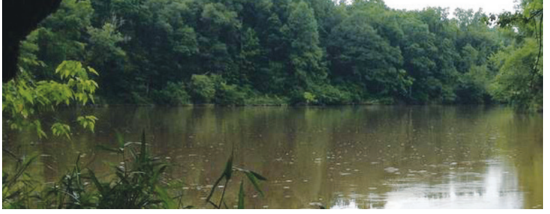
Oconee River Land Trust

Due to limited seating in the van, registration for this class will be capped at 13, so you will need to act quickly when registration opens to get in on this opportunity to enjoy these beautiful preserved natural spaces in Georgia's countryside.