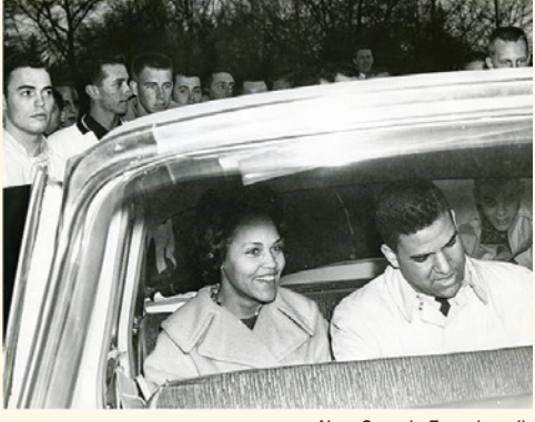
New Georgia Encyclopedia

All three talked about the important role of the Presbyterian Student Center at UGA. Before integration, the Center provided a