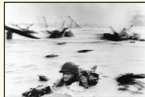
Iconic photo of the D-Day invasion on the beaches of Normandy in northern France.

Those who want to participate in the battlefield portion of “March to Victory” must register for and attend the classroom lectures. Registration for the multi-session course will open on September 8, 2017 . Booking for the trip will be handled directly by the tour company, Go Ahead Tours, a subsidiary of EF Educational Tours. The cost of the trip (based on double occupancy, airfare to and from