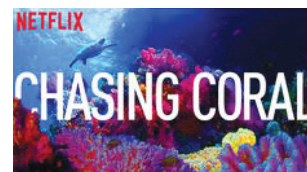
“Chasing Coral” documentary on Netflix