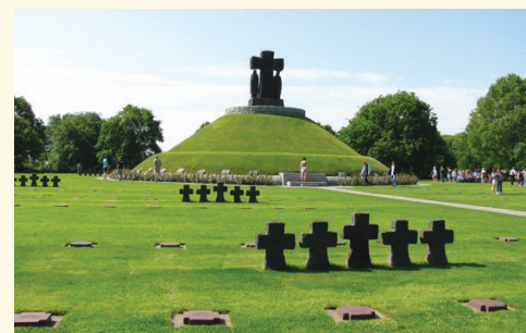
Memorials to the fallen soldiers on D-Day in World War II.