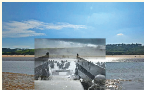
Normandy then and now. Old black and white photo set into color photo of modern view.