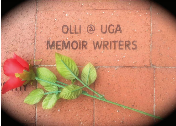
OLLI@UGA Memoir Writers chipped in proceeds from their anthology to buy a brick at the Athens-Clarke County library.