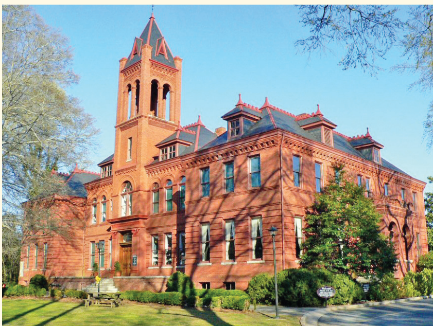
Madison-Morgan Cultural Center

The Madison-Morgan Cultural Center, which is located in a restored school building, welcomes visitors to a historic structure that contains exhibits of how life was lived in this gracious antebellum town in the 19th and 20th centuries. Visit www.mmcc-arts.org to learn more.