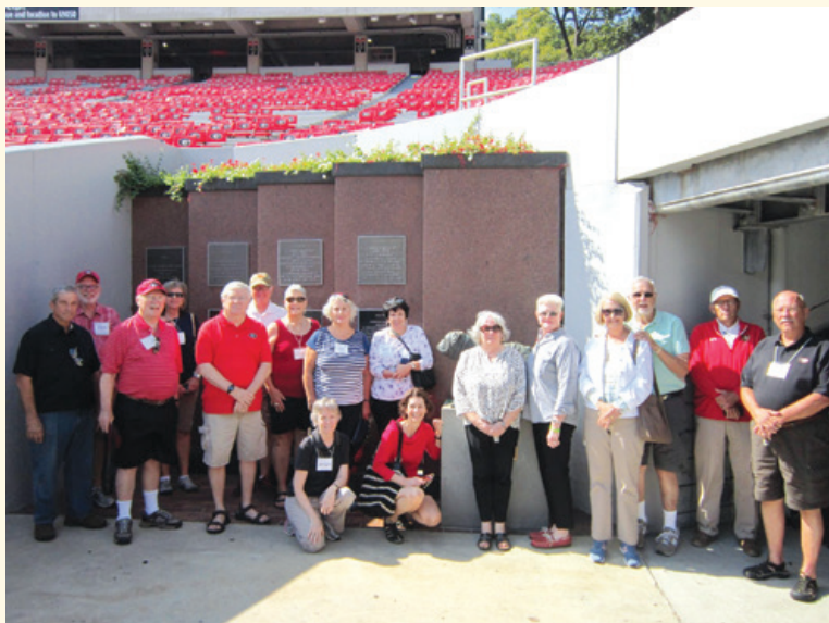
A November stadium tour group