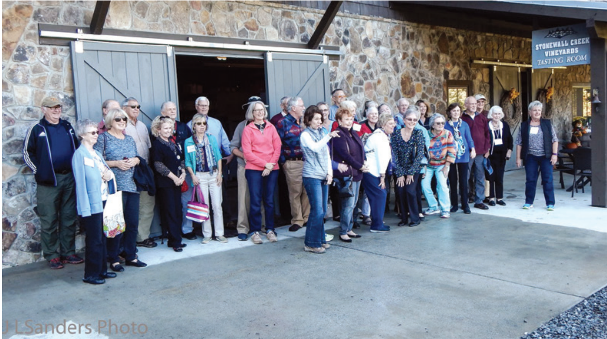
OLLI members on the STONEWALL CREEK VINEYARD TRIP October 13.