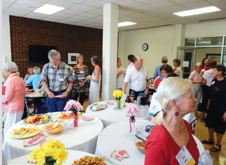
New Members Orientation reception