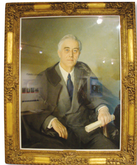
Portrait of FDR at Little White House

OLLI members may register online or through the OLLI office with paper registration and check. While an OLLI member must register for the trip, it is permissible to add to the registration a spouse, friend, or relative who is not an OLLI member. The deadline for registering for this event is September 15. Cost: single occupancy, $348; double $296; price includes all transportation, Thursday lunch, Thursday dinner, overnight lodging and Friday breakfast, as well as all admission charges and gratuities.