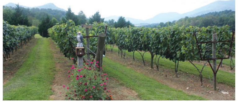
12 Spies Vineyard and Farm