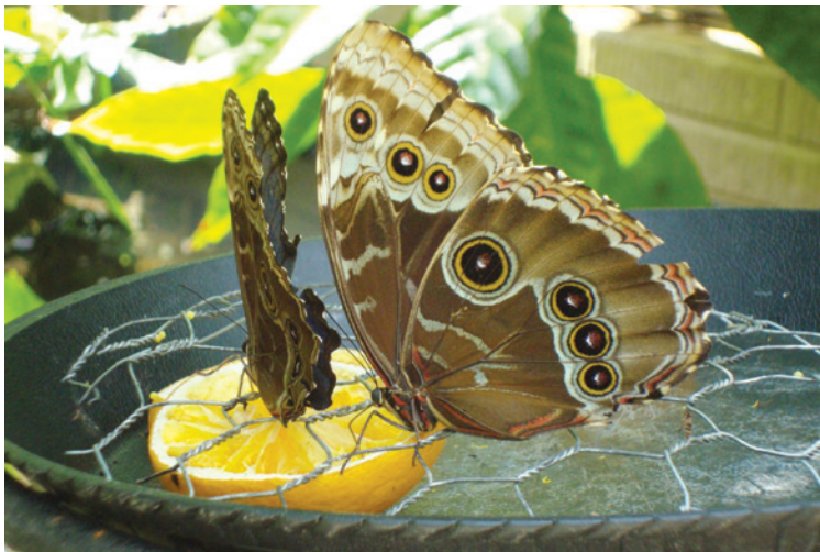
Tropical butterfly in the Cecil B. Day Butterfly Center at Callaway Gardens

Join OLLI friends as you tour the sites and hear the stories of the legacy of Franklin Delano Roosevelt in Georgia on an overnight trip that will conclude with the fall foliage displays and the renowned Butterfly Center at Callaway Gardens.