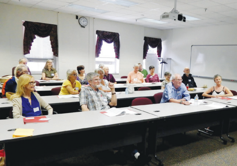
New OLLI Members at Orientation presentation