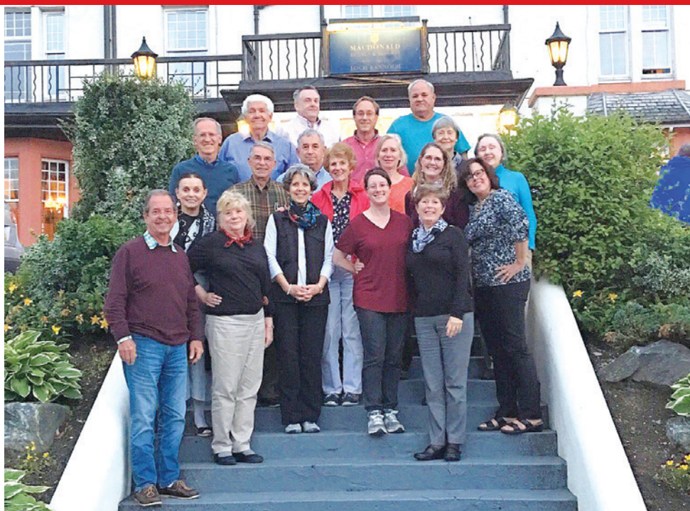
OLLI members in Scotland on steps of Loch Hannoch hotel