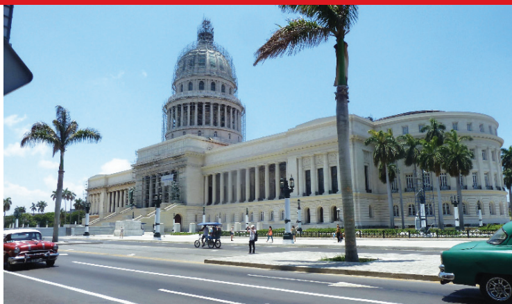
Capital building in Havana