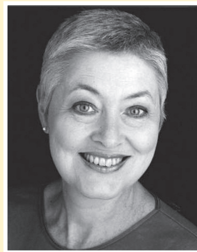
Actress Brenda Bynum