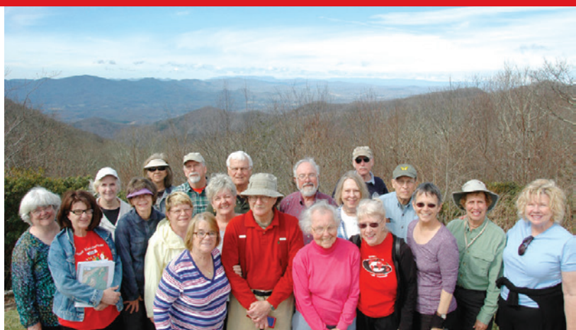
The group on top of Brasstown Bald, Georgia's highest peak (4,784 feet), Western Blue Ridge Province.