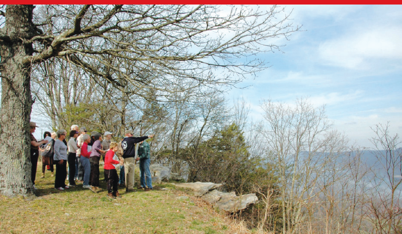
Trip participants on an overlook on Lookout Mountain, Georgia Valley and Ridge Province.