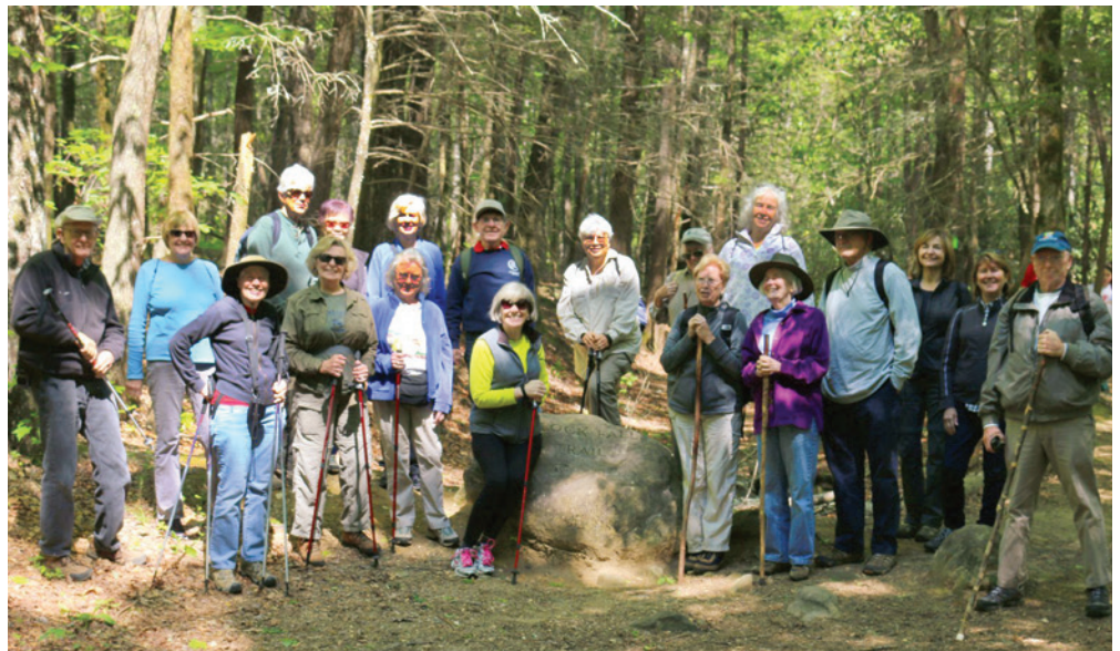
▲ HAPPY HIKERS Happy Hikers at Hemlock Falls May 5.