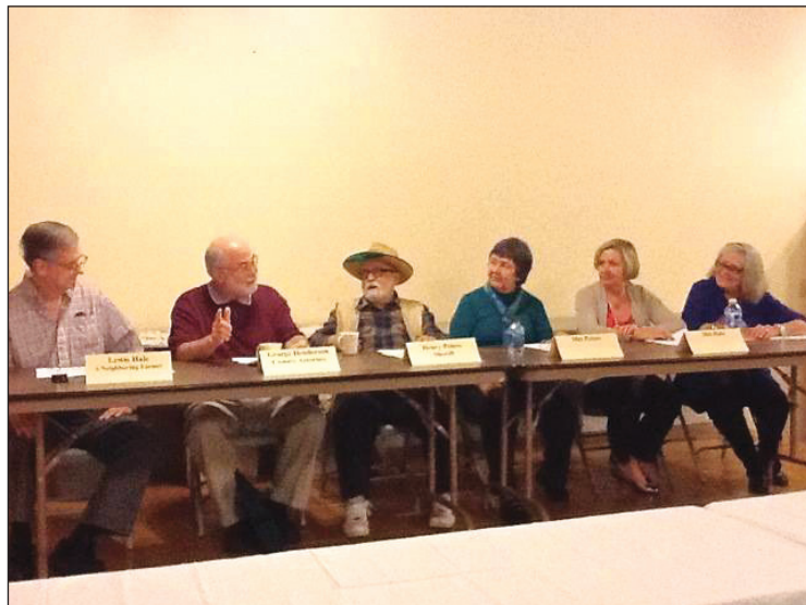
Members of the Play Readers Club presenting Susan Glaspell's 1916 play Trifles .