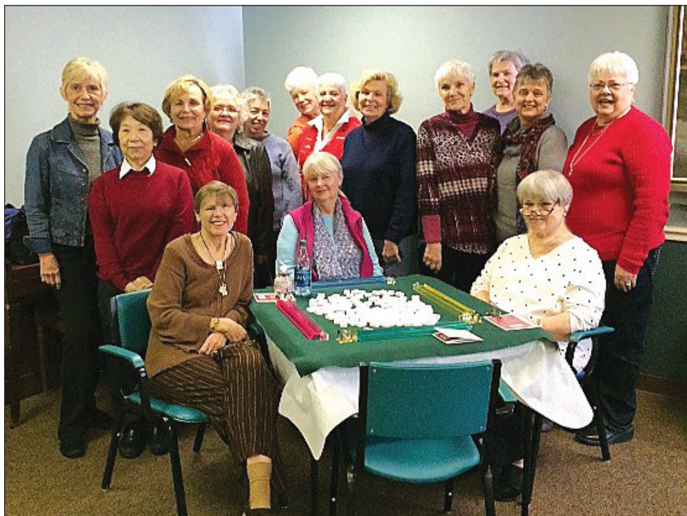
Mahjongg SIG members at Talmage Terrace