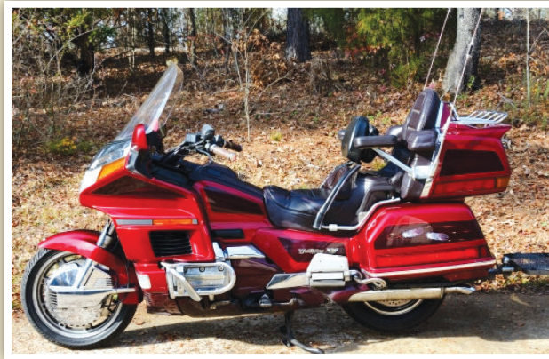
Big Red—Warren's Gold Wing motorcycle

Someone once said that you know you're having an adventure when you're facing danger, your senses are fully alert, adrenaline is nearly or actually pumping, and you wish with all your powers of wishing that you were someplace else. Young people seem to think that after 70 we're in a recliner in front of the TV with no real adventures left. I can tell you that's wrong, dead wrong. . . .