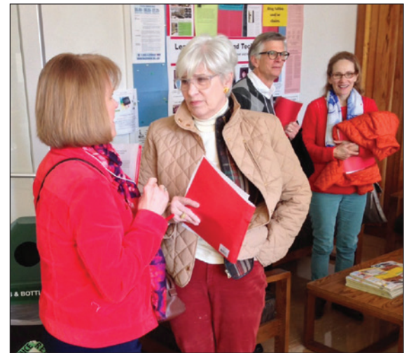
Newbees chat in the breakroom

“ We could certainly slow the aging process down if it had to work its way through Congress. ”