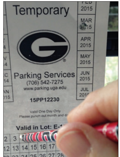
Soon to be relegated to the OLLI@UGA archives

This new system will be much more convenient for both staff and OLLI members. For members, the new plastic tags mean no more remembering to purchase enough individual tags; no more punching the correct date holes each time they park (checking to see they've gotten the right date!); no more cleaning old tags out of the car, no more running into the office to purchase a tag at the last minute, then running back to their car to hang it before class. At the same time OLLI staff