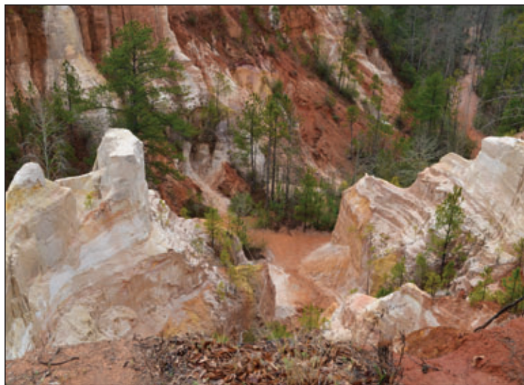
One of the group's views of Providence Canyon, created from erosion due to poor farming practices in the 1800s