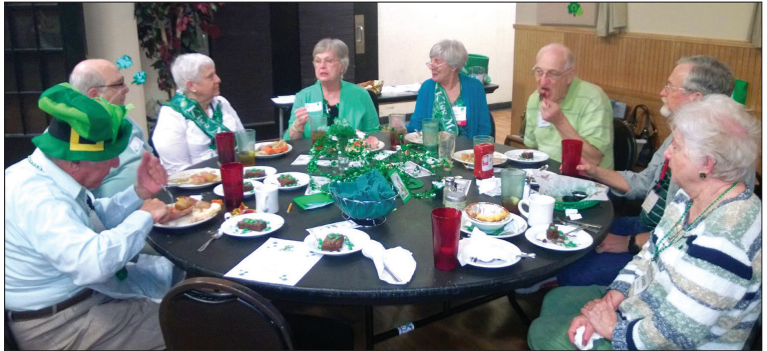
The wearin' of the green at the St. Patrick's Day luncheon, Buffalo's Café