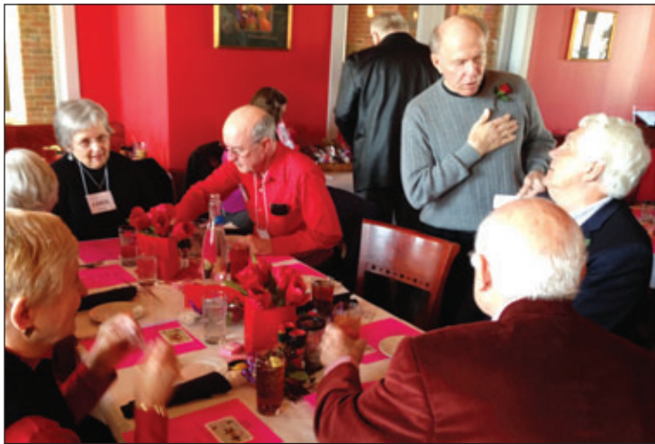
Valentine luncheon at Charlie Noble's Restaurant, complete with nosegays, boutonnieres, old friends and new