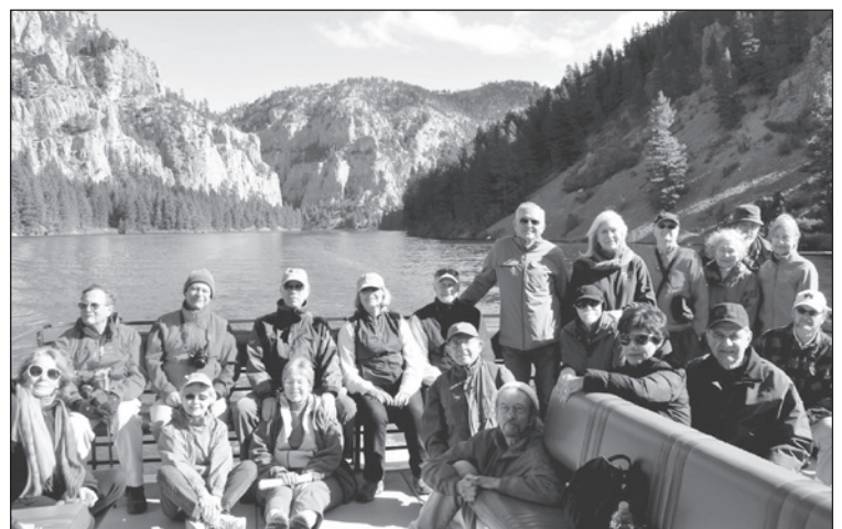
On the Missouri River at Gates of the Mountain