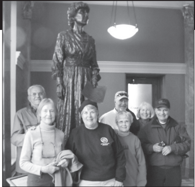
An Athens-Montana Connection! OLLIs with statue of Jeannette Rankin in the Montana state capitol in Helena. Rankin was elected by Montana in 1916 to be the first woman in the U.S. Congress; the sale of her Watkinsville, GA property (where she lived for several years) funded the Jeannette Rankin Foundation, headquartered in Athens.