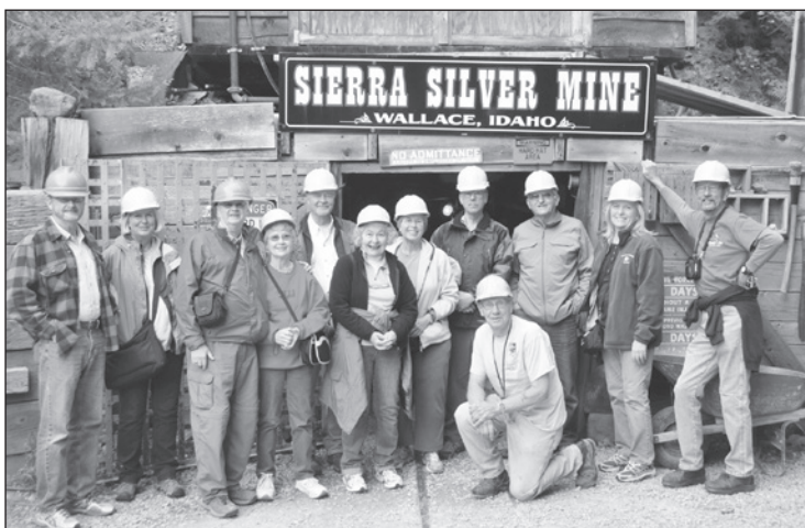
Part of the group at the Sierra Silver Mine, Wallace, Idaho