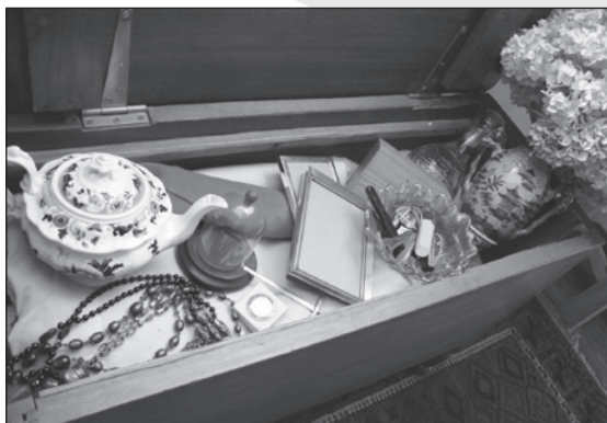
You never know what you might find at OLLI's "Junque from the Trunk" sale.