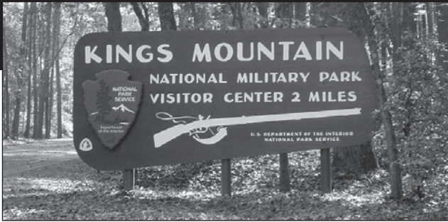
Sign marks entrance to King's Mountain National Military Park