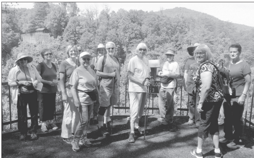
The Happy Hikers ended their Spring Calendar in May with a hike at Tallulah Gorge Park in North Georgia. The weather was glorious, the views of the falls camera-worthy.