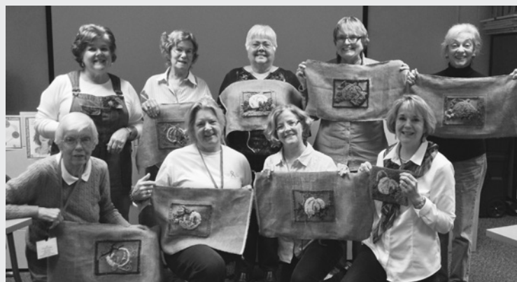
OCTOBER 28: Members and teachers of Benedicte Milward’s rug-hooking workshop