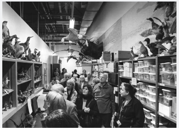
DECEMBER 9: OLLIs on tour of UGA Museum of Natural History