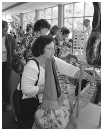
Scene from the 2013 Art Fair