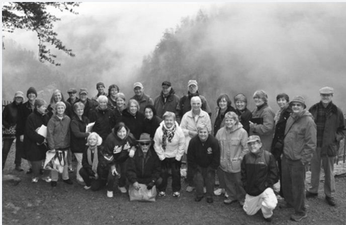
NOVEMBER 21: OLLIs on the OLLI Rocks trip posing by a foggy Tallulah Gorge