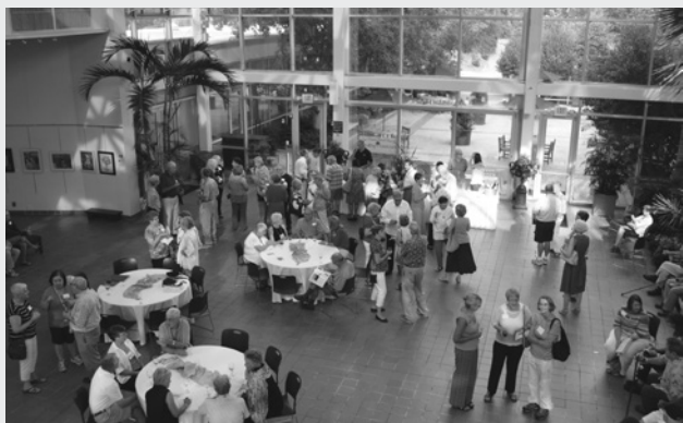
AUGUST 6: Crowd at the Botanical Garden for the first “OLLI Presents” event