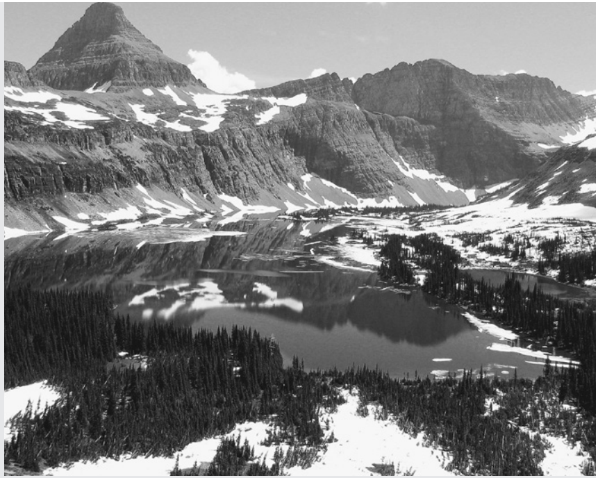
Glacier National Park, one of the sites we will visit during this excursion

Travel will be with minivans, and stops will visit overlooks and roadside exposures. Limited walking will be required. There is a non-refundable registration fee of $675 per person. This covers the costs of van rental, fuel, organizational expenses and the daily OLLI excursion fee. The registration fee does not include participant airfare, lodging, meals and entrance fees. The region is a very popular tourist destination;