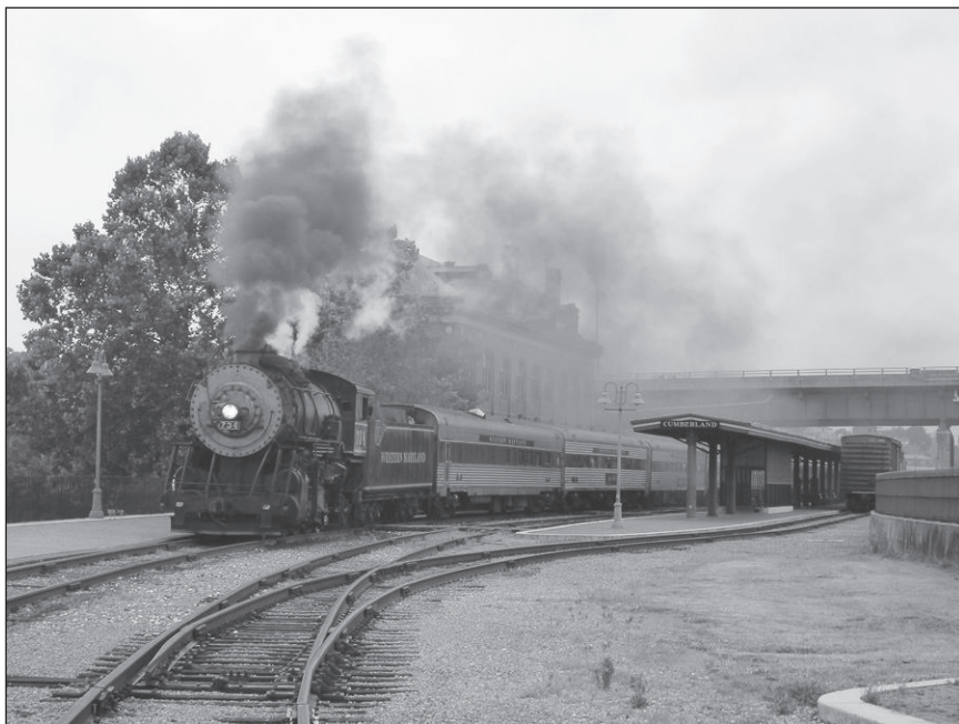
Trains were often part of the scenery.