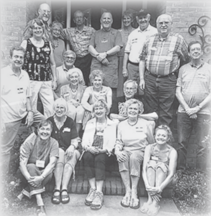
The Halloween Carnival Planning Committee – having fun already.

The OLLI Halloween Carnival FUNdraiser is open to members and their guests. We wish it weren't, but the event is limited to 200 – first come, first served. Tickets will be sold via the OLLI website and at the OLLI office. The ticket price is $25. Be sure to watch your email and the OLLI website for the ticket sales opening date and other exciting details.