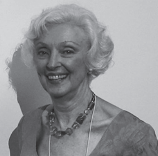
Our SIG Committee Chairs