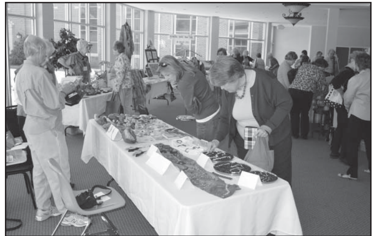
Visitors examine jewelry at the 2012 OLLI Art Fair