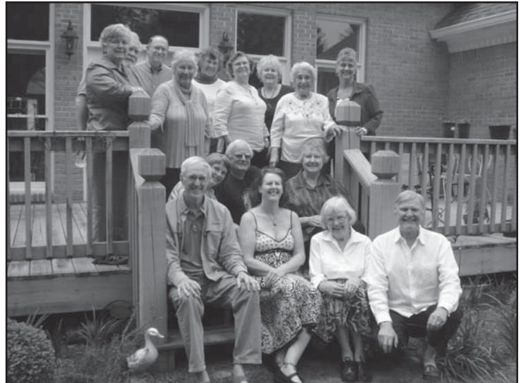
Memoir Writing Group gathered for their Annual Luncheon