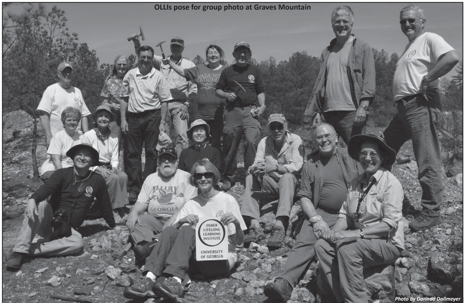
OLLIs pose for group photo at Graves Mountain