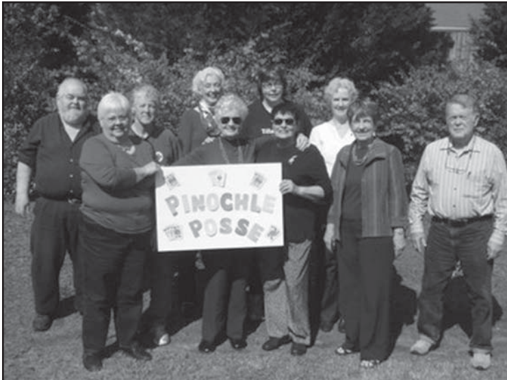
The Pinochle Posse

To learn more about the Pinochle Posse, contact Tom Kenyon at tkenygroup@aol.com .