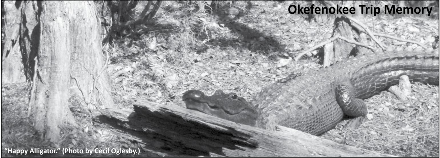
Okefenokee Trip Memory