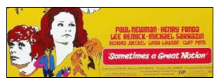
JULY 18 SOMETIMES A GREAT NOTION