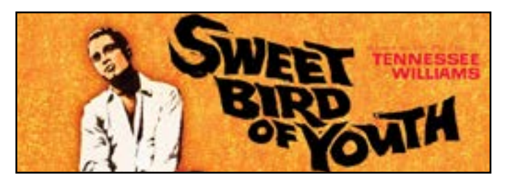
JULY 11 SWEET BIRD OF YOUTH