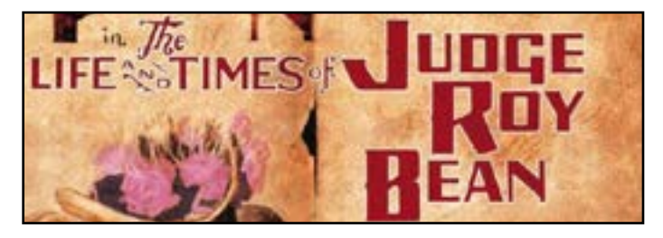
JULY 25 THE LIFE AND TIMES OF JUDGE ROY BEAN