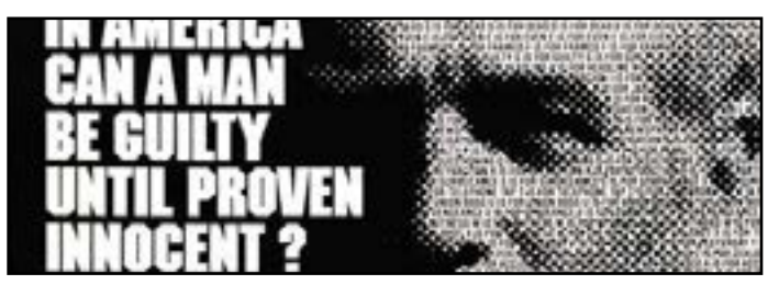
AUGUST 1 ABSENCE OF MALICE